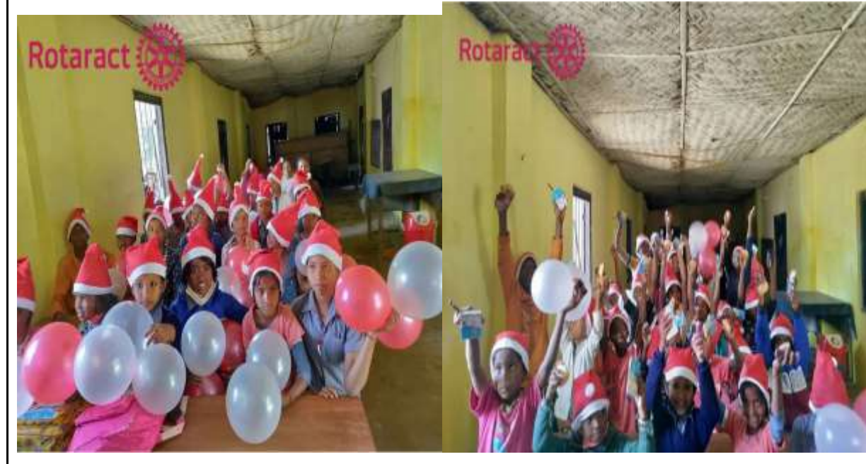
New Year Celebration at Orphanage Gyanankush: 1-1-2019