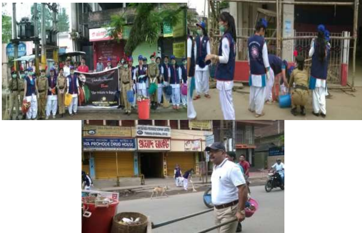
Cleanliness Drive in daily Bazar road and Durgabari: 2-10-2018