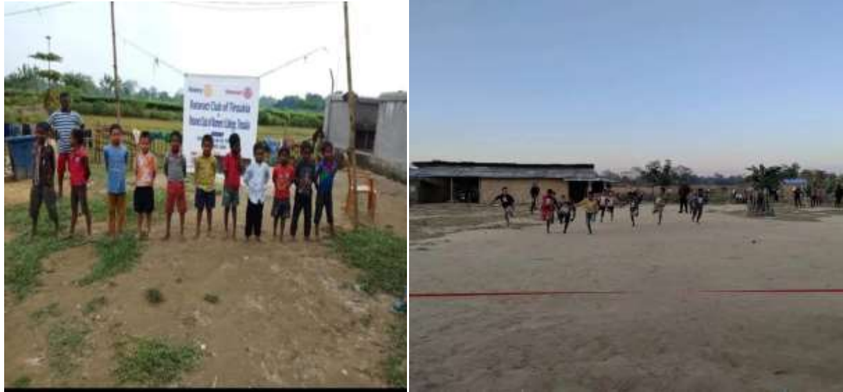
Kid's Olympic at Gyanankush: 2-12-2018