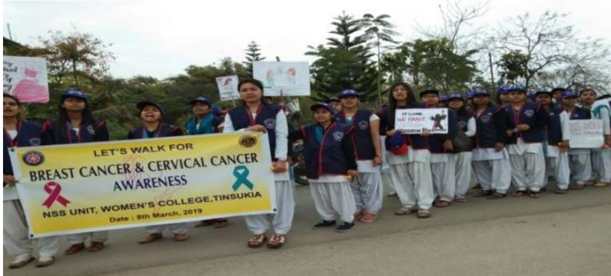
Walkathon on breast cancer and cervical cancer awareness: 8-3-2019