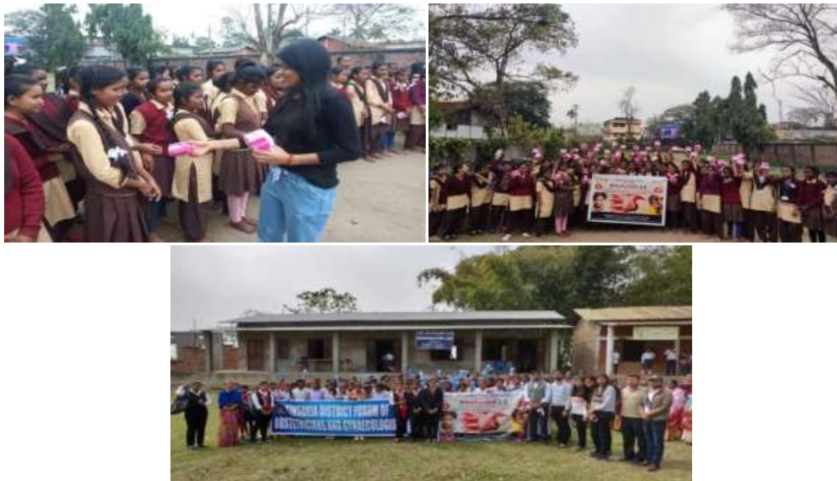
We For Her (Sanitary Napkin Distribution at a Govt. School in Guijan): 8-3-2019