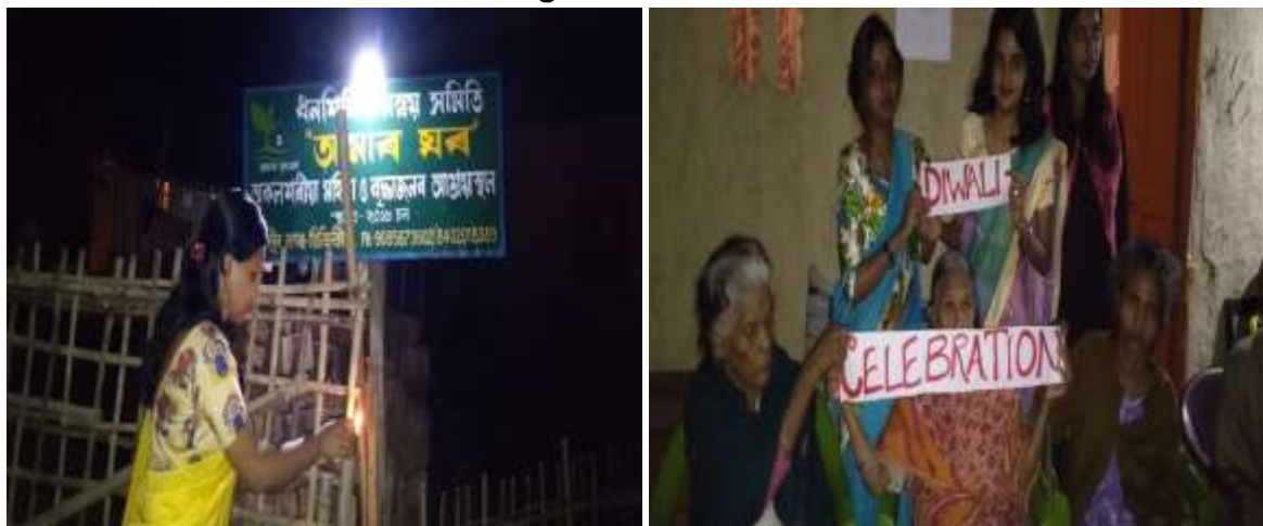
Diwali Celebration at Old Age Home " Amar Ghor Tinsukia ": 5-11-2018