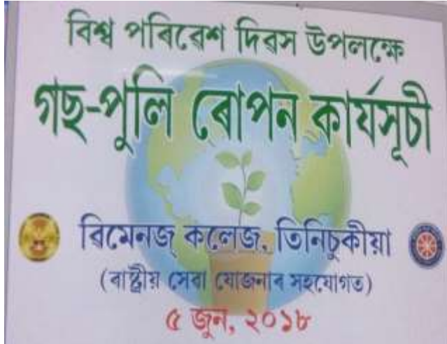
Mass plantation in Janumukh village: 5/6/2019