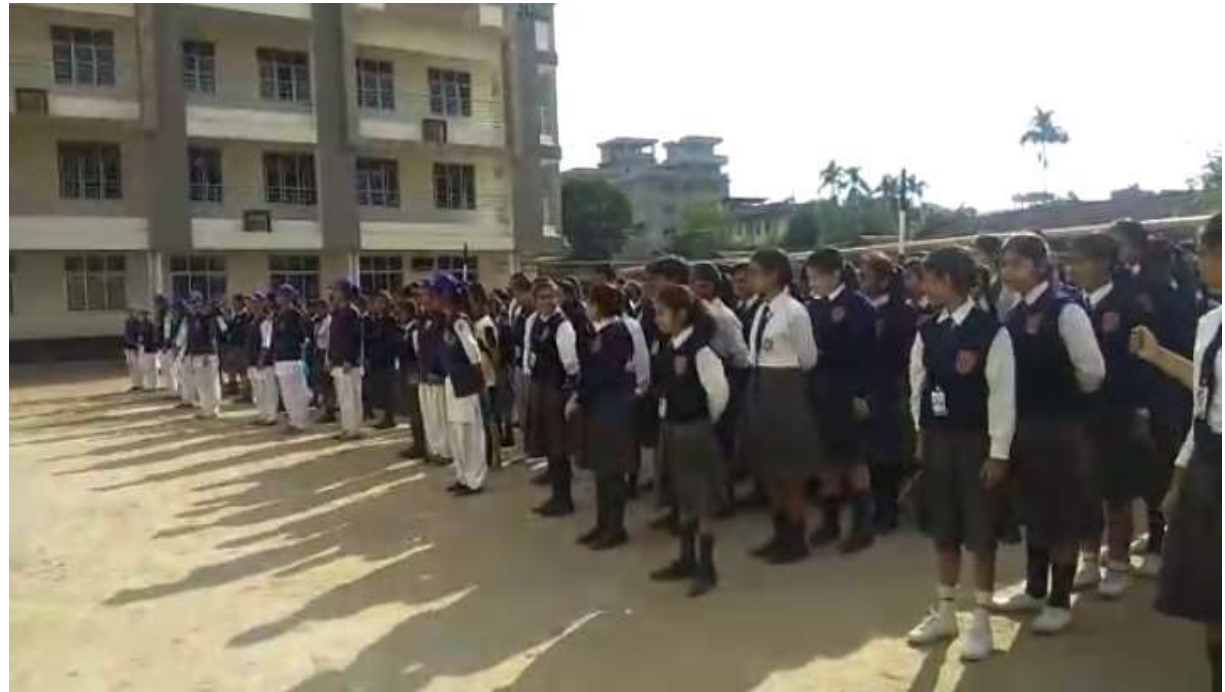
Pledge for Life in G.S. Lohia College: 3-12-2018