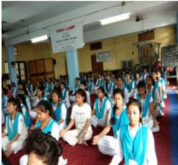
Yoga Camp: 17-6-2019-21-6-2019