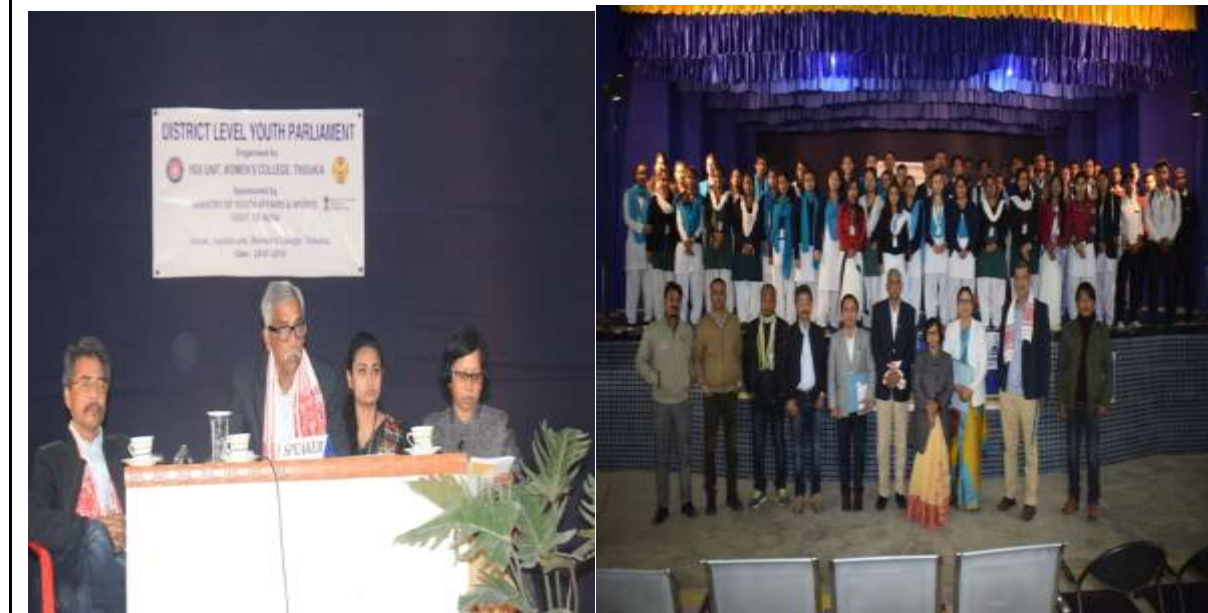
Debate Competition (District Youth Parliament): 24-1-2019